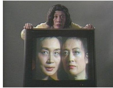
08 Kiyoko's Situation (1989)