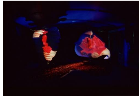
10 Still Life (1993–2000)

This film depicts the struggles of an artist couple, focusing on the protagonist, who is overwhelmed by household chores and assisting her husband with his work, as she resists being oppressed and seeks to reclaim her own artistic practice. The film features Idemitsu's installation Still Life (1993–2000). By combining techniques explored in her previous works, such as the projecting of images onto objects, this work represents a culmination of her artistic practice.