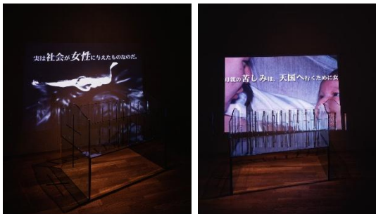
11 Real? Motherhood (2000)

Video is projected onto two objects symbolizing male and female. The form of the anthurium flower evokes masculinity, while its counterpart represents femininity. The repetitive motif of peeling off petals and securing them with pins that was seen in Idemitsu's previous works, as well as the falling red petals, symbolize a kind of inner conflict, contradiction, and physicality. The sound was composed by contemporary musician Ayu Takahashi.