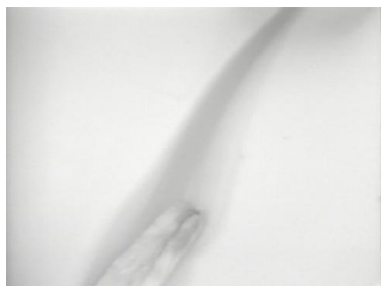
05 What a Woman Made (1973)