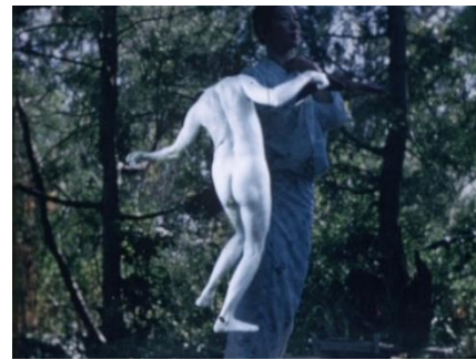
02 Inner Man (1972)