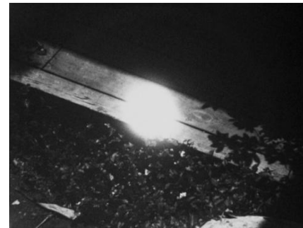
04 At Santa Monica 3 (1975)