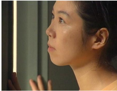
09 Kae, Act Like a Girl! (1996)

Kiyoko, who aspired to be a painter, married at the insistence of her parents, and found her path to artistic expression blocked as she became overwhelmed by the responsibilities of housework and child-rearing. Depicted here is the inner turmoil and anguished cry of a woman who, unable to suppress her desire for self-expression, finds herself increasingly cornered. Dedicated to the director's eldest sister, who died suddenly in Paris after struggling to pursue her dream of becoming a painter, this film has won international acclaim.