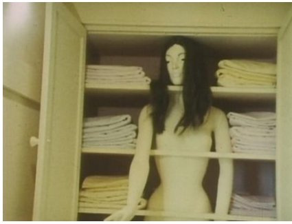
01 Woman's House (1972)

Idemitsu visited the "Womanhouse" exhibition, organized in 1971 by artist Judy Chicago and others, and filmed the event. She documented artists working in the exhibition space located in an old house they had renovated with the help of students, and completed the film as her first 16mm work after about a year of editing.