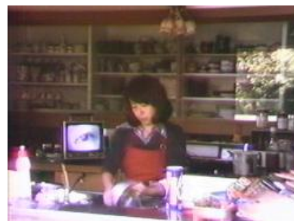
06 Another Day of a Housewife (1977)

In the summer of 1973, upon returning to Japan, Idemitsu was asked to submit a work for a video screening and produced this, her first video piece. Using black-and-white open-reel equipment, she filmed a used tampon floating in a toilet. Having secured her first opportunity to screen her work, Idemitsu continued to produce art while traveling back and forth between Japan and the United States. This work is the first video piece (1973) that established Idemitsu's reputation as a video artist, and it serves as the title of this exhibition.