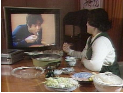
07 Hideo, It's Me, Mama (1983)