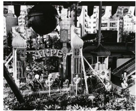
[ 3 ] Kanemura Osamu, from the series Today's Japan , 1993, Gelatin silver print Collection of Tokyo Photographic Art Museum

Born in Tokyo. Early in his career, Kanemura began shooting urban landscapes in black and white. He has received widespread acclaim both in Japan and abroad for exhibitions such as New Photography 12 , held at the Museum of Modern Art in New York in 2006. In 2000, Kanemura received the 19th Domon Ken Award, and in 2014, the 39th Ina Nobuo Award.