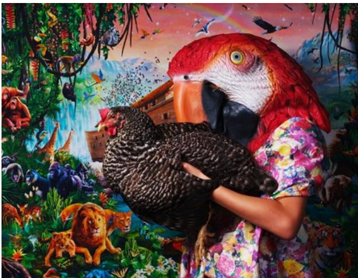
Utsu Yumiko, Chicken and Macaw , 2022

Oct. 27, 2023 - Jan. 21, 2024 | 3F Exhibition gallery