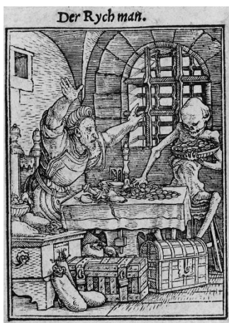
0-01 <Images of Death>: The Richman

The origins of memento mori are explored in the context of medieval times.