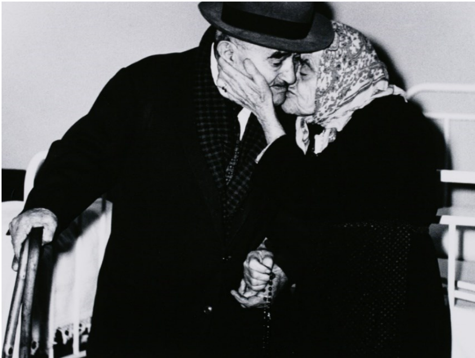
Mario Giacomelli, From the series Death will come and will have your eyes, c.1954-1968, Gelatin silver print, Collection of Tokyo Photographic Art Museum

Jun. 17—Sep. 25, 2022 | 2F Exhibition Gallery