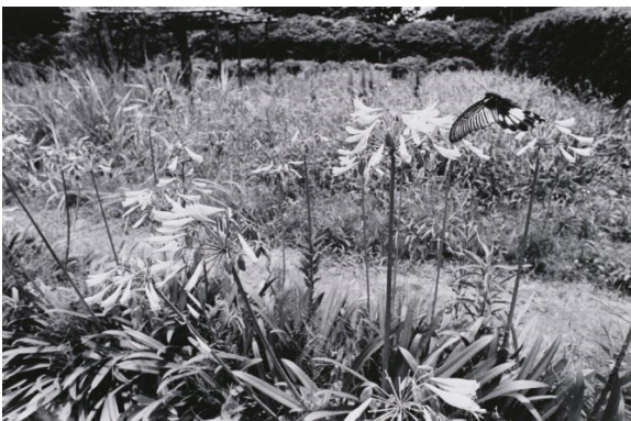
2-01 | Nobuyoshi Araki, From the series of Sentimental Journey, 1971, Gelatin silver print, Collection of Tokyo Photographic Art Museum

Whereas some people confront death directly through unavoidable hardships such as war, famine, and disease, others feel a closeness to death despite not encountering such hardships directly. Perhaps this is especially true for those who have left their native lands in search of new livelihoods and feel solitude when separated from their spiritual homes. This part focuses on the relationship of memento mori and the loneliness that lurks in people's hearts.