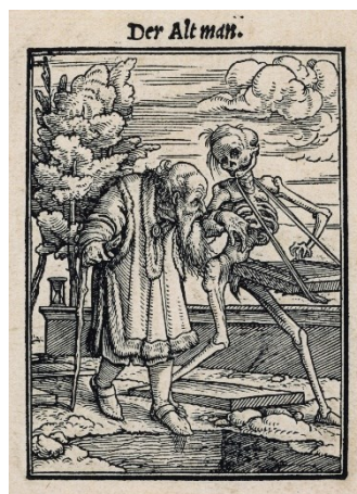
0-02 <Images of Death>: The Old Man