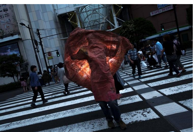
Human Spring 2018 Collection of the Artist ©Lieko Shiga