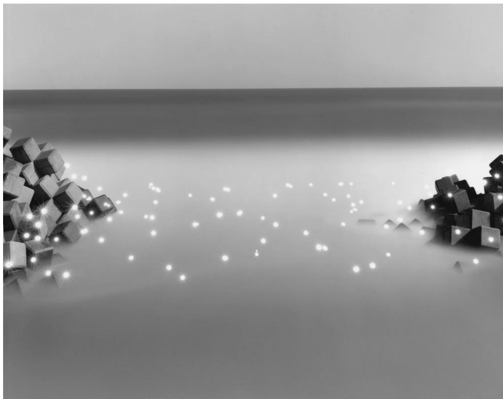
From the Photo-Respiration series, 2013

Venue: Tokyo Metropolitan Museum of Photography 2F Exhibition Gallery