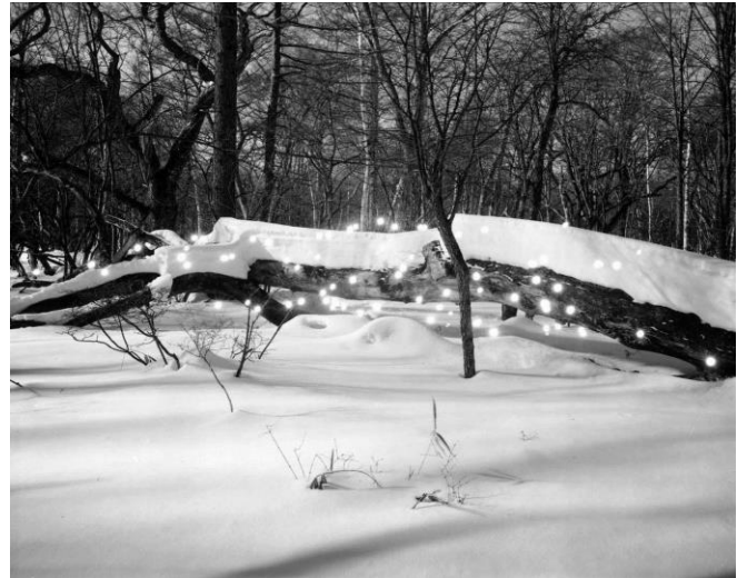
(Upper and lower images: from the Photo-Respiration series, 2013)