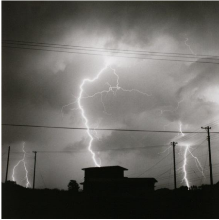
from House, 22 June 1968, TMMP collection