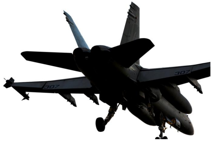
from BASE, 2005-2012 Atsugi, 2009, private collection