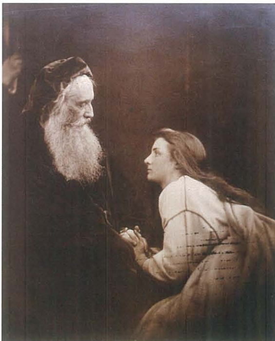
Julia Margaret Cameron, Prospero and Miranda , c.1865-67, Victoria and Albert Museum