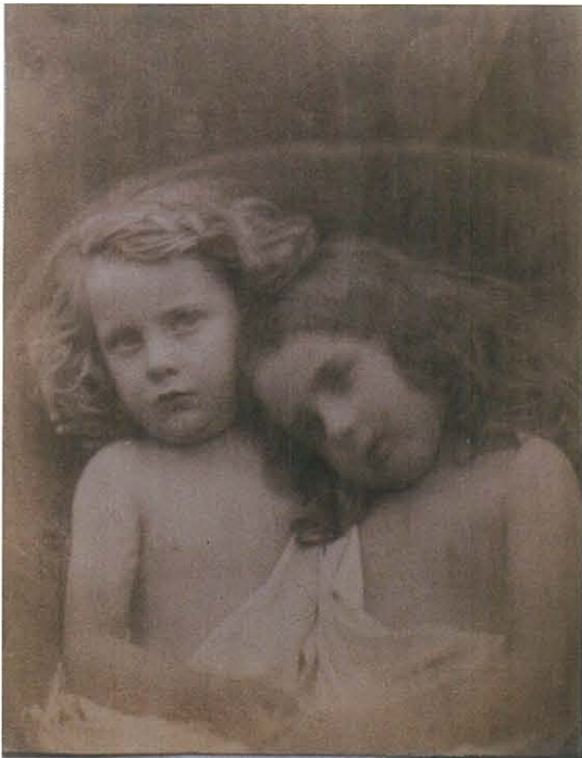
Julia Margaret Cameron, The Infant Bridal , 1864, Victoria and Albert Museum