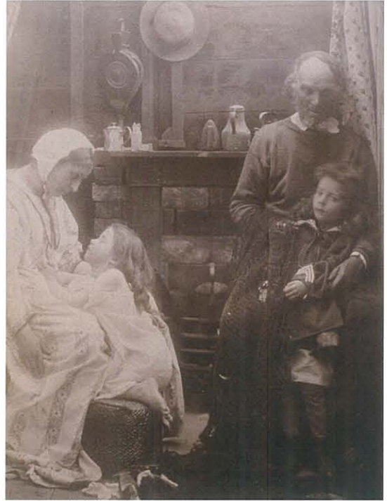
Julia Margaret Cameron, Group Illustrating the Song, 'Three Fishers Went Sailing Out Into the West' , n.d., Victoria and Albert Museum