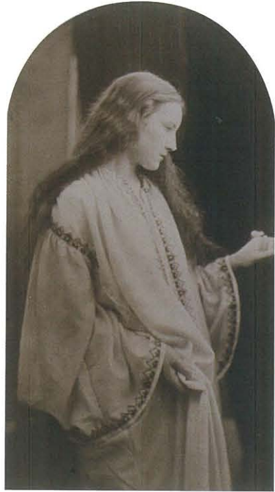
Julia Margaret Cameron, The Guardian Angel , n.d., Victoria and Albert Museum