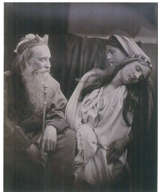
Julia Margaret Cameron, King Lear , c.1864, Victoria and Albert Museum