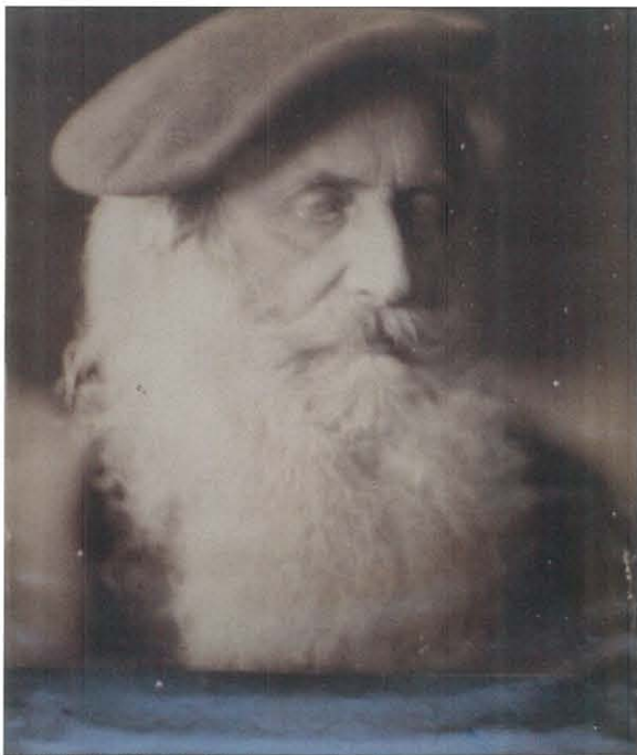
Julia Margaret Cameron, Sir Henry Taylor , 1865, Victoria and Albert Museum