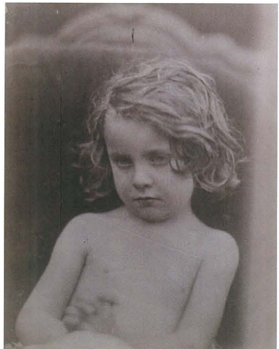
Julia Margaret Cameron, First Ideas , 1865, Victoria and Albert Museum