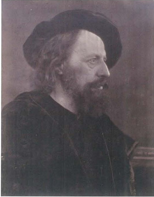
Julia Margaret Cameron, Alfred Tennyson , 1865, Victoria and Albert Museum