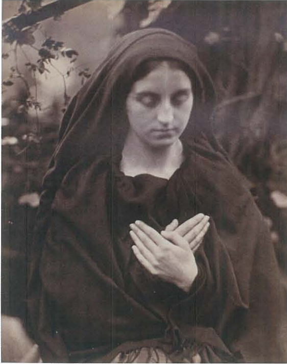
Julia Margaret Cameron, Compensive Nun Devout and Pure, Sober, Steadfast and Demure , n.d., Victoria and Albert Museum