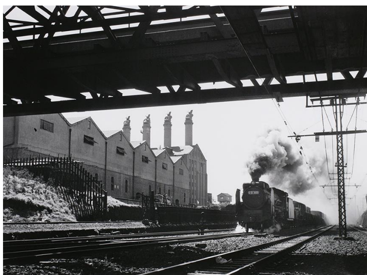
Kuroiwa Yasuyoshi D51 488 Yamate Freight Line (Ebisu) 1953 Gelatine Silver Print

This exhibition of works from the collection of the Tokyo Photographic Art Museum has the theme of time travel.