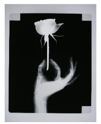
15 Idemitsu Mako, Another Day of a Housewife, 1977, Single-channel video 16 Onodera Yuki, No.1 from the series Camera, 1997, Gelatin silver print