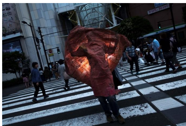
Left) From the series Human Spring, I Catatonia 2019 Collection of the Artist ©Lieko Shiga