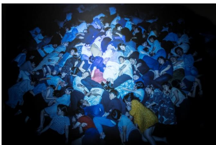
Human Spring 2018 Collection of the Artist