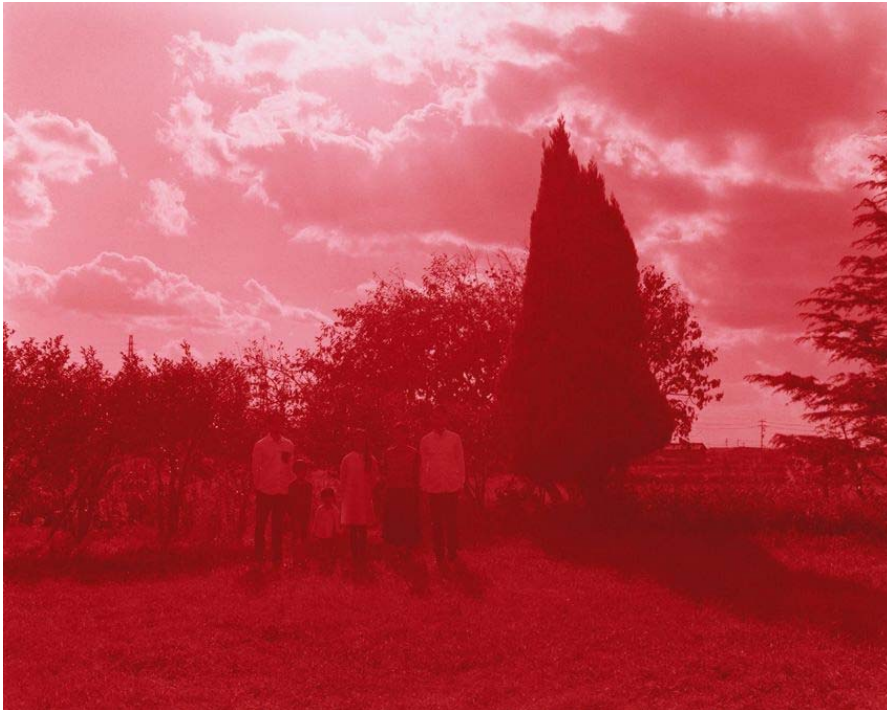
Eiki Mori, from the series Family Regained , 2017 (reference image)