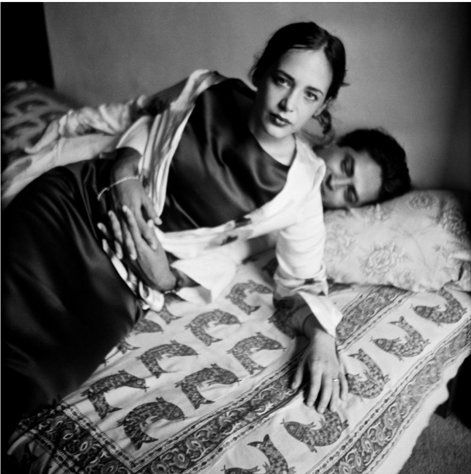
From <Museum of Chance> 2013, Archival pigment print

We hope that you will enjoy the world of Dayanita Singh in this, her first solo exhibition to be held in a Japanese museum.