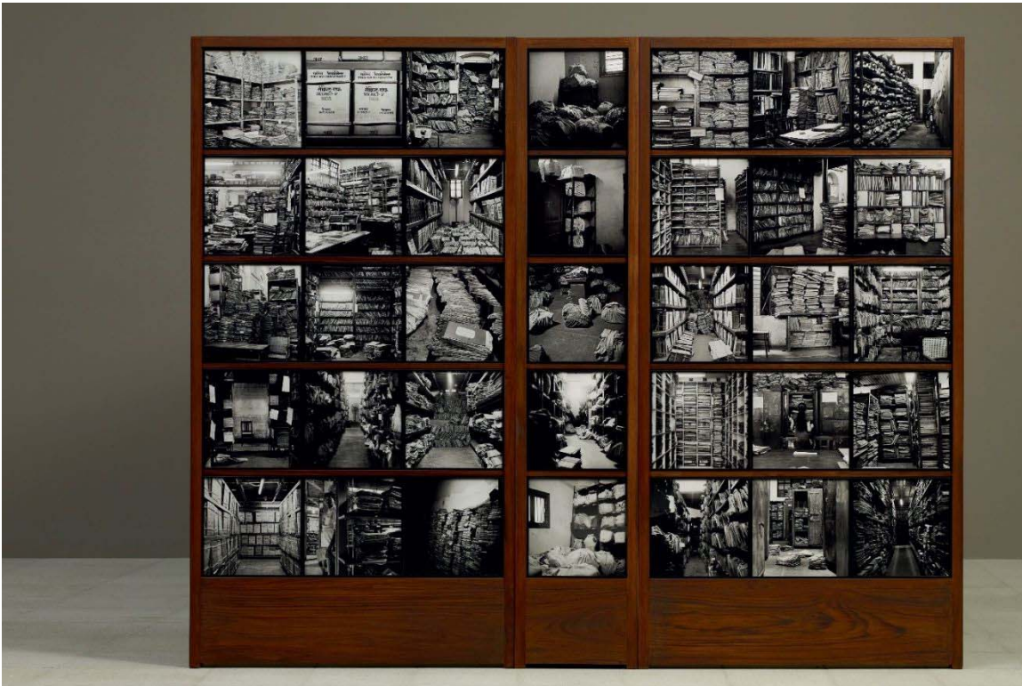
<File Museum> 2012

By 2016 Dayanita has built more than ten 'museums' and together they form what she named the 'Museum Bhavan' (Hindi for 'large house'). 'File Museum' is a portable, folding structure, handmade of teak, 227 cm. tall, that opens out to become 132 cm. wide. Inside it contains one hundred and forty-two framed works and just like looking at works in a conventional art museum, we can walk around this 'museum' and enjoy a maximum of up to forty works. The works are displayed in five rows vertically and with one, three or seven rows horizontally, depending on which side is being viewed; each work can be appreciated individually while those before or next to it intervene, facilitating the creation of vertical or horizontal sequences. In an ordinary museum it is common to change the works on display and in this one too, Dayanita doubles as the curator, selecting different works from the one hundred and forty-two stored inside and substituting them at random times. It possesses a collection of works, there is a curator and the exhibits are changed; in other words, it can be said to incorporate all the functions of a regular museum.