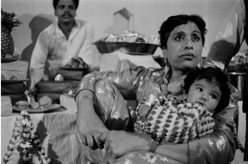
From <Myself Mona Ahmed> 1989 – 2000, gelatin silver print, collection of Tokyo Photographic Art Museum