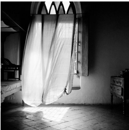
below from <Museum of Chance> 2013