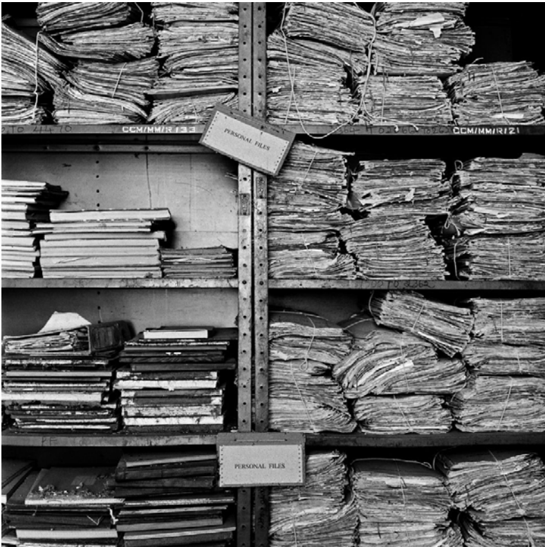
From <File Museum> 2012