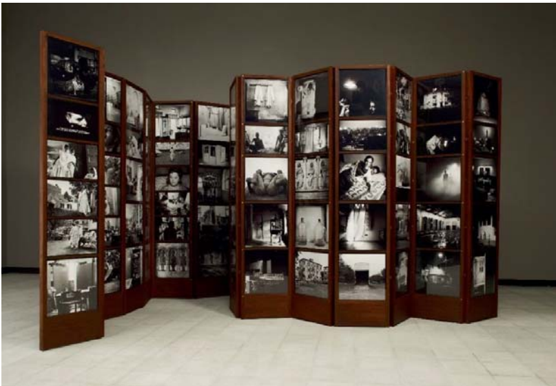
left from <Museum of Chance> 2013