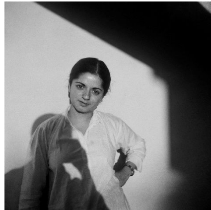
Left: <Little Ladies Museum – 1961 to Present> 2013