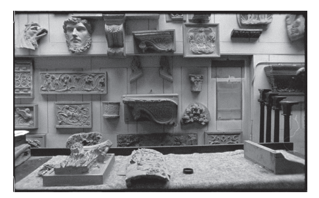
fig.14 Still from Inventory