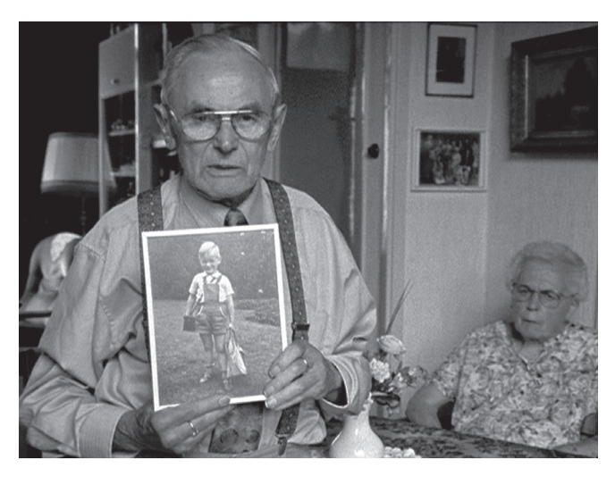
fig.4 Still from Kingdom of Shadows

I think that dreams of flying are something that just about everyone has. I have memories of flying in my dreams as a child—not very gracefully; it was more like swimming. Deep down everyone has a desire to fly and I realized this through my work. The source of my inspirations are not always easy to pinpoint but I suddenly had an image of being lifted up by balloons. I realized much later that this idea had come from a book I'd read in my childhood based on the famous French