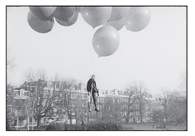
fig.6 Still from Lift (16mm film)