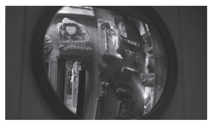
fig.15 Still from Inventory

starting point of a museum is the collection. The building is something that follows suite. Nearly all collections start out as private collections, and the collection shown in Inventory is an example of one of the earliest public museums. Architect Sir John Soane built up a private collection and displayed it in his own home in London. In 1833, a Private Act of Parliament was passed that ruled that his house would remain untouched after his death. It's a wonderful experience to go and walk inside his house. It's almost like being in a time capsule: It's as if he had just walked out the door [fig.14, 15].