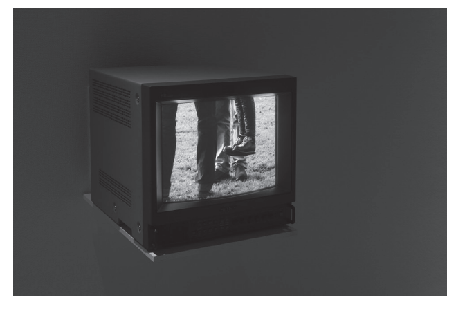
fig.5 Lift (detail of installation)