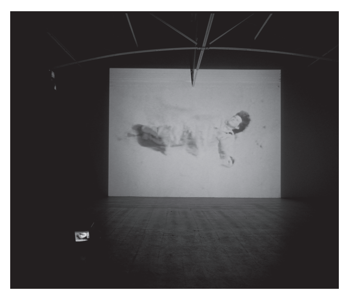
fig.8 Roll I & II

children's film Le Ballon Rouge (The Red Balloon).