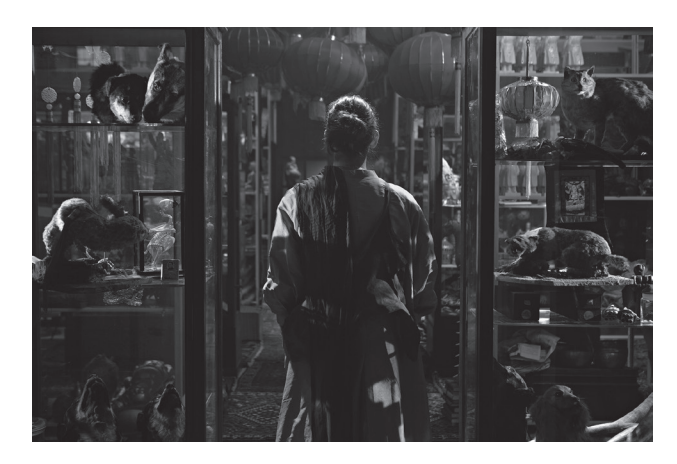
fig.9 Still from Disorient