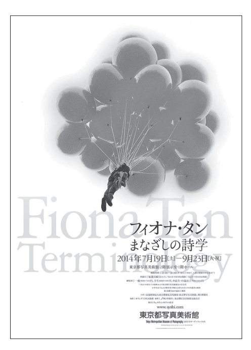
fig.2 Poster for the exhibition designed by MORI Daishiro

Japanese. After discussing with Fiona, we decided to reexamine this term from a different standpoint and came up with the Japanese title—a reference to the poetic aspect of the moving image. The starting point of the exhibition was the concept of terminology, which was something that initially came up in a discussion with Fiona [fig.2].