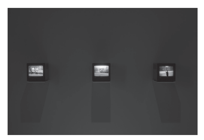
fia.7 Lift. Stills