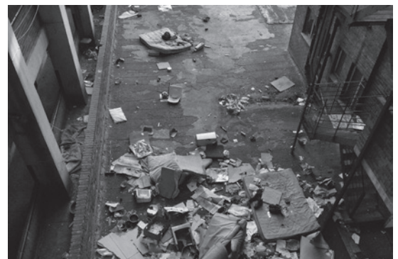
Fig.8 Eviction aftermath, Noverna Court, Paul Nel Street, Hillbrow