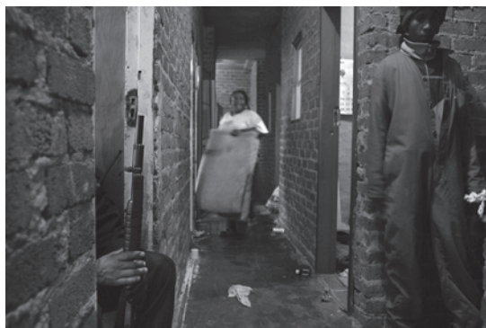
Fig.7 Eviction by the Red Ants, Auret Street, Jeppestown