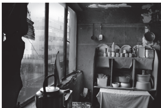
Fig.2 (Upper left)

A map of central Johannesburg at the Inner City Regeneration Project office, City Council, Loveday Street