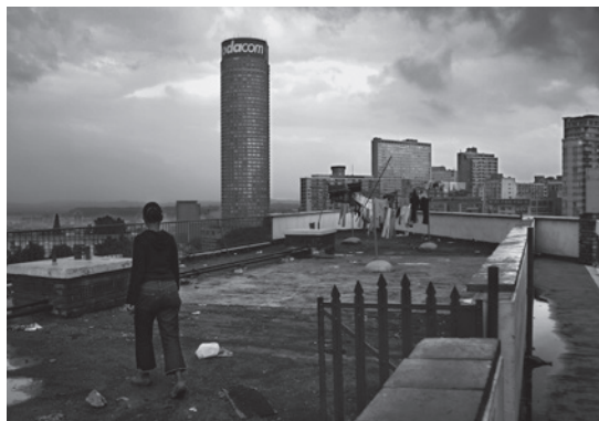
Fig.1 Al's Tower, a block of flats on Harrow Road, Berea, overlooking the Ponte building