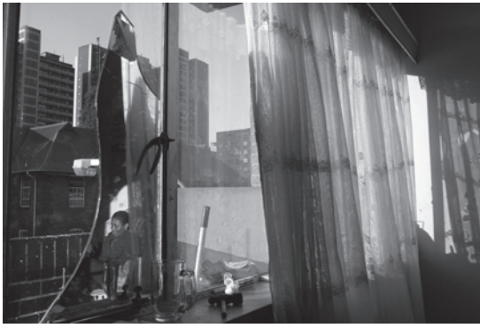
Fig.9 Pinky Masoe at her home in Sherwood Heights, Smit Street. The building's water and electricity had been cut off for four months